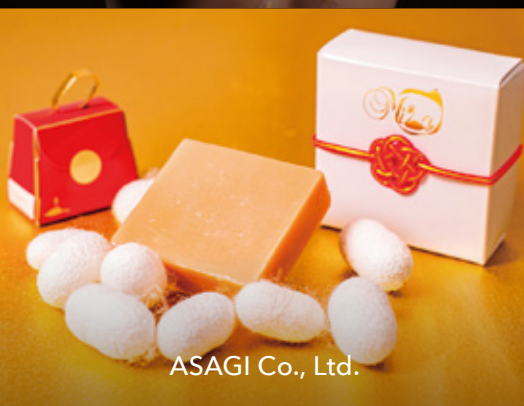
ASAGI Co., Ltd.