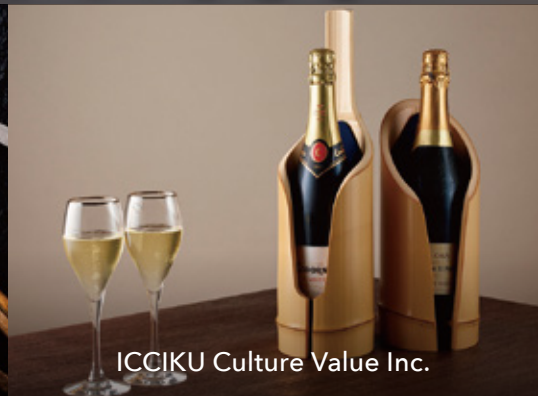
ICCIKU Culture Value Inc.