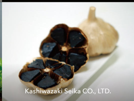
Kashiwazaki Seika CO., LTD.