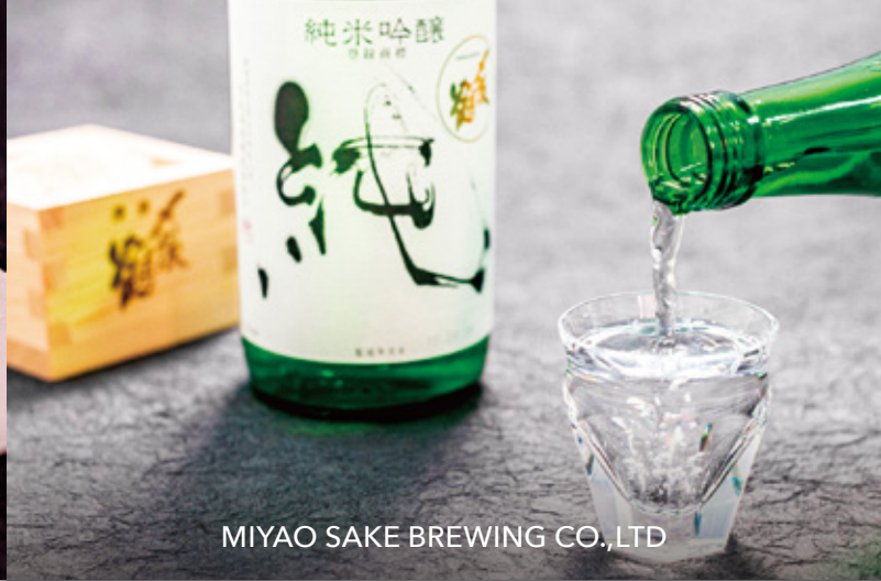
MIYAO SAKE BREWING CO.,LTD