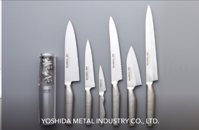
YOSHIDA METAL INDUSTRY CO., LTD.